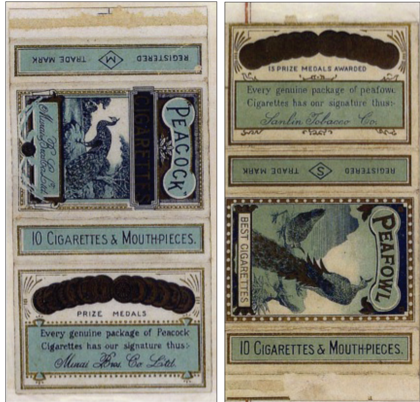
Figure 6 "Peacock" brand and "Peafowl" brand.